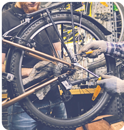
Car and Bike Workshops