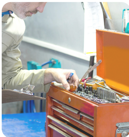
Small Equipment Assembly