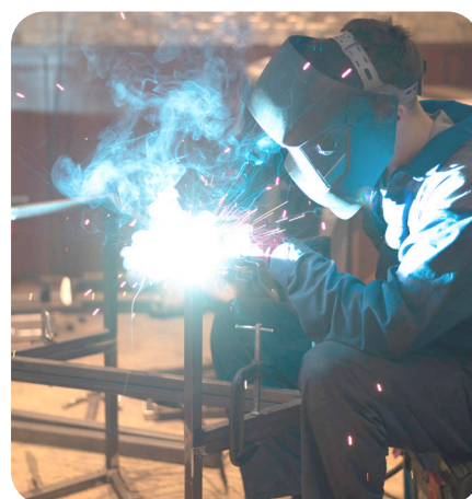
Small Mechanical Workshops