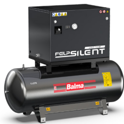
Silent Piston Compressors